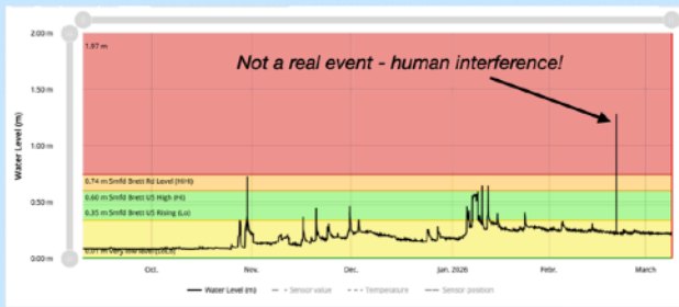
Upstream Gauge (US)